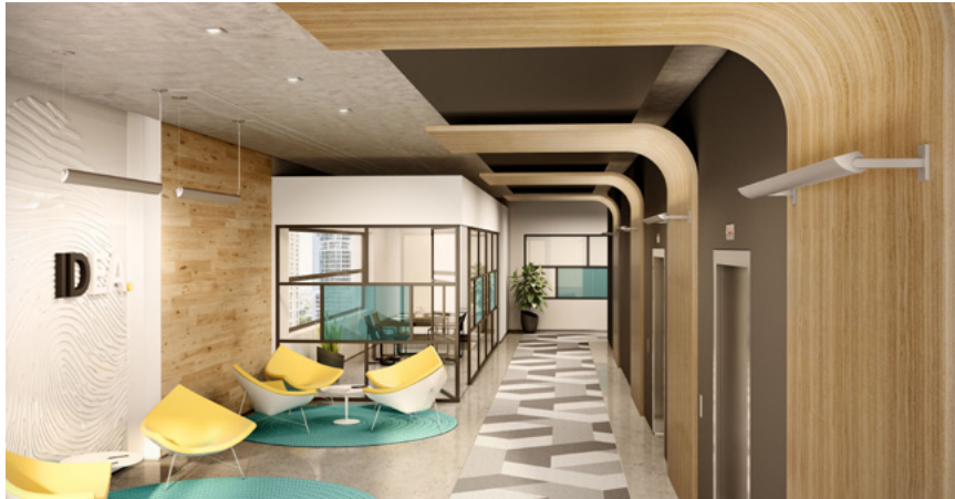
Axle pendant and wall