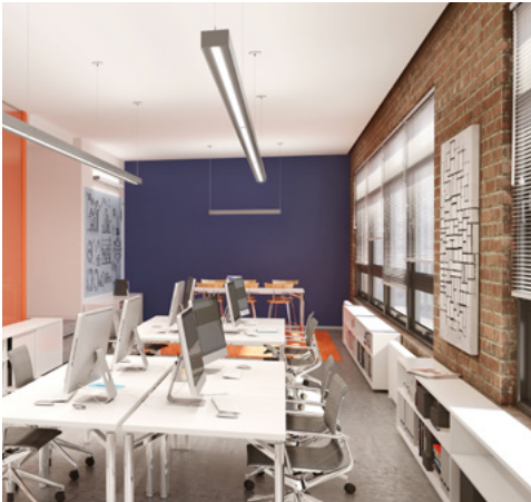
Canyon pendant cable