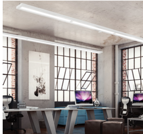
Reven pendant cable