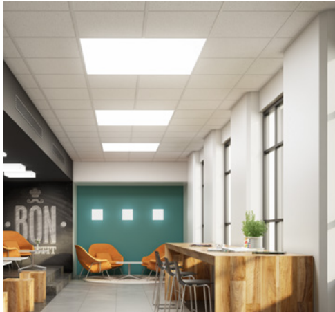
POP Recessed square 1X1