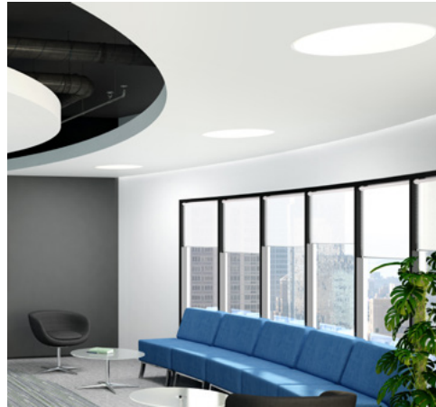
POP Recessed round 24