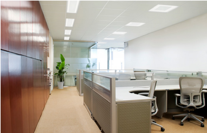
Primo recessed 1X4 & 2X2