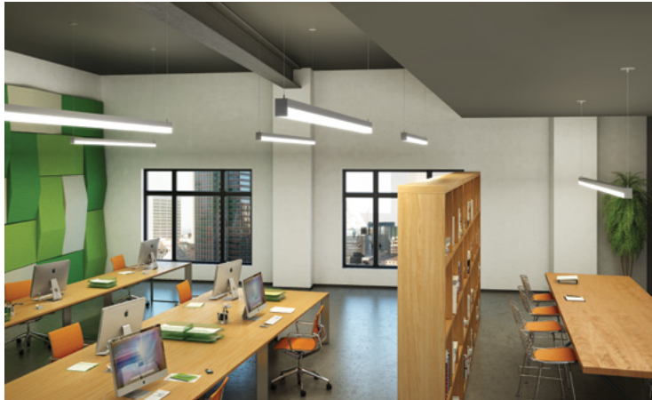
Quad pendant cable