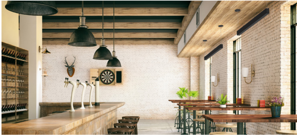
Via 2 pendant cable indirect