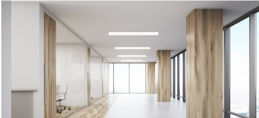
Via 1.5+ surface