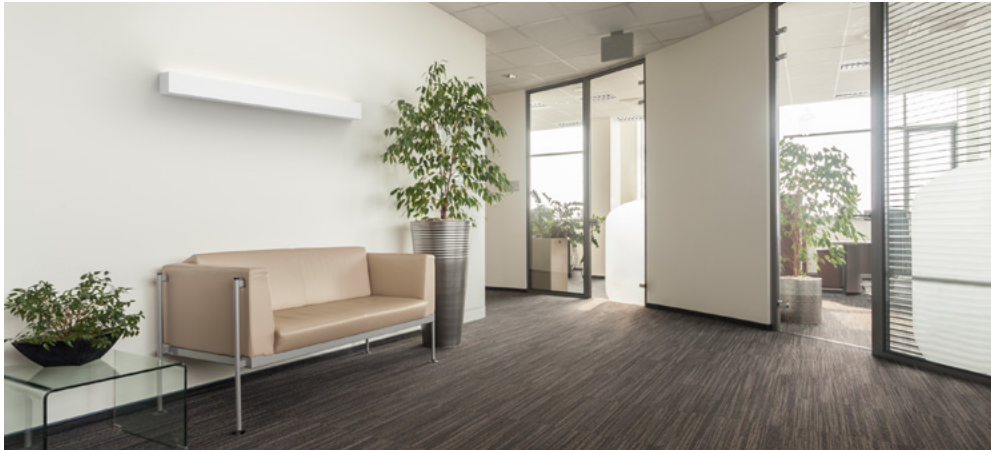
Via 4 wall indirect