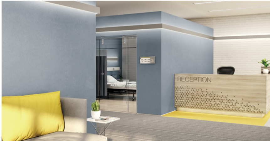
Walo wall direct/indirect